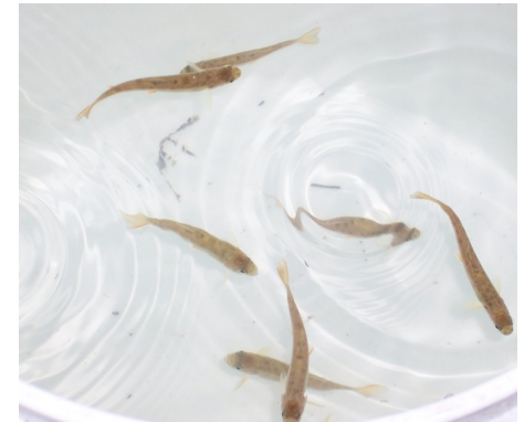
. . . care for and release them as fingerlings.