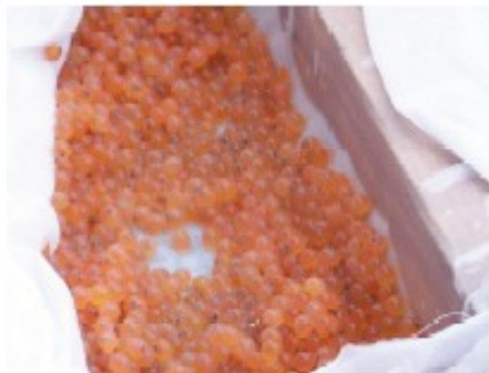
Student raise trout from eggs . . .

As the program progresses, students learn to see connections between the trout, water resources, the environment, and themselves.